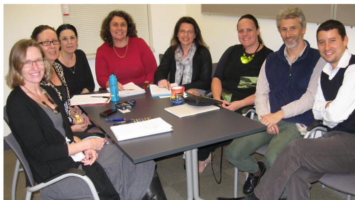
Members of the PAEDS Coordinating Centre at our weekly meeting.

We hope you enjoy the rest of this newsletter and can join us in celebrating the ongoing success of the PAEDS network.